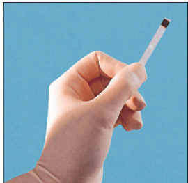
When the strip turns black, the solution is effective.

Check the colour in the test zone after 10 seconds.